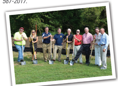
Groundbreaking of RVP Bridge August 2014